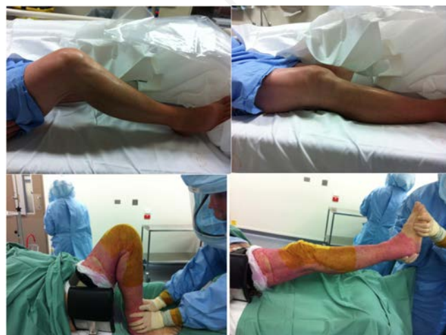
Figure 1. Pre and post-operative patient photographs.

WOMAC, Western Ontario and McMaster Universities Arthritis Index scores; OKS, Oxford knee score; ROM, range of motion.