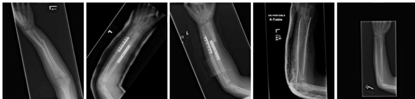
Figure 2. Nine year old boy presented with open fracture after fall from a slide. ORIF was performed at the time of initial debridement. A year and a half later patient fell from a bicycle and fractured around his implants. Revision fixation with nails was performed. Recanulation of the bones was necessary to pass nails through the previous area of plating. Removal of nails was performed at 6 months.

The question of plate removal versus retention has been debated in the literature. Studies examining retention of implants have reported refracture, bony overgrowth and immunologic reactions to the implants. 32 The most common indication for plate removal is pain at the site of hardware, more commonly at the site of ulnar fixation. Significantly, Peterson et al. called for plate removal in those involved in contact sports due to concern for refracture at the area of stress riser generated by the retained plate. 32 If plate removal is elected, the literature has shown this practice to be safe, however the evidence is low. Kim et al. reviewed 43 fractures in patients with a mean age of 10.6 years at time of removal. Three refractures occurred in 2 patients, and all were the result of a new trauma. They concluded the