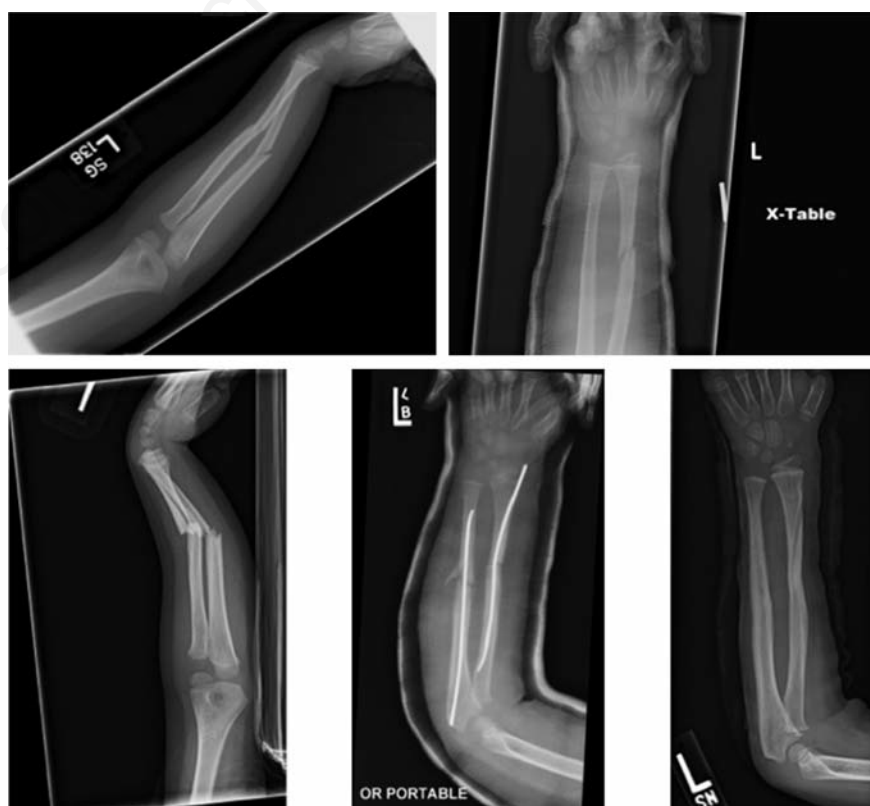
Figure 3. Six year old male who suffered initial fracture after a fall. Initial closed management was successful. Six months after initial injury he fell from a motor scooter and refractured. Intramedullary fixation was elected. Removal at 6 months post operatively is the routine at our institution.

Complications have been reported to be associated with intramedullary flexible nailing