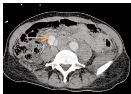
Figure 2. Axillary computed tomography scan shows the expansion of the dissection to the iliac artery.