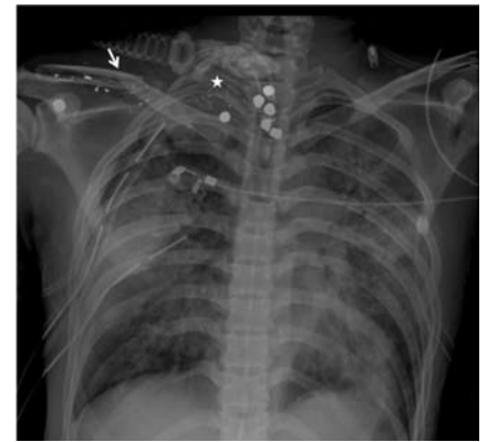
Figure 1. Pre-operative X-ray on Day 6 after shotgun injury showing right open comminuted clavicle fracture (white arrow) and non-displaced right second rib fracture (star) with contamination from multiple metallic fragments, hemopneumothorax treated with bilateral ICD and tracheostomy, and multiple pellets on upper thoracic spine, right upper lung and right coracoid.

cal Betadine ointment and daily wound dressing. The wound healed within two weeks after the operation. The shoulder was immobilized in an arm sling and the patient was allowed to perform shoulder passive and active-assisted range of motion (ROM) for two weeks, followed by active ROM. Follow-up clinical examination and X-rays of the clavicle were performed periodically. The fracture showed uneventful clinical and radiographic union by eight weeks post surgery; therefore, the LCP was removed under local anesthesia at the bedside. The patient was admitted to our hospital for four months in order to follow intensive rehabilitation and ambulation training. Before discharge, he was able to sit upright independently and bear weight on his right arm with full shoulder range-of-motion. The patient could stand with Hip-Knee-Ankle-Foot orthosis and he was able to walk with a walker and an assistant. No infection or other complication was observed during one year post surgery. Soft tissue profile and follow-up radiographs are shown in Figure 3.