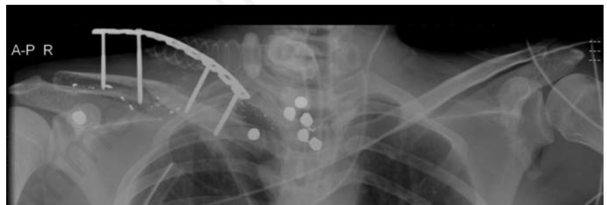
Figure 2. Post-operative X-rays of both clavicles after LCP external fixation revealed stable fixation and nearly anatomical reduction of right clavicle fracture.