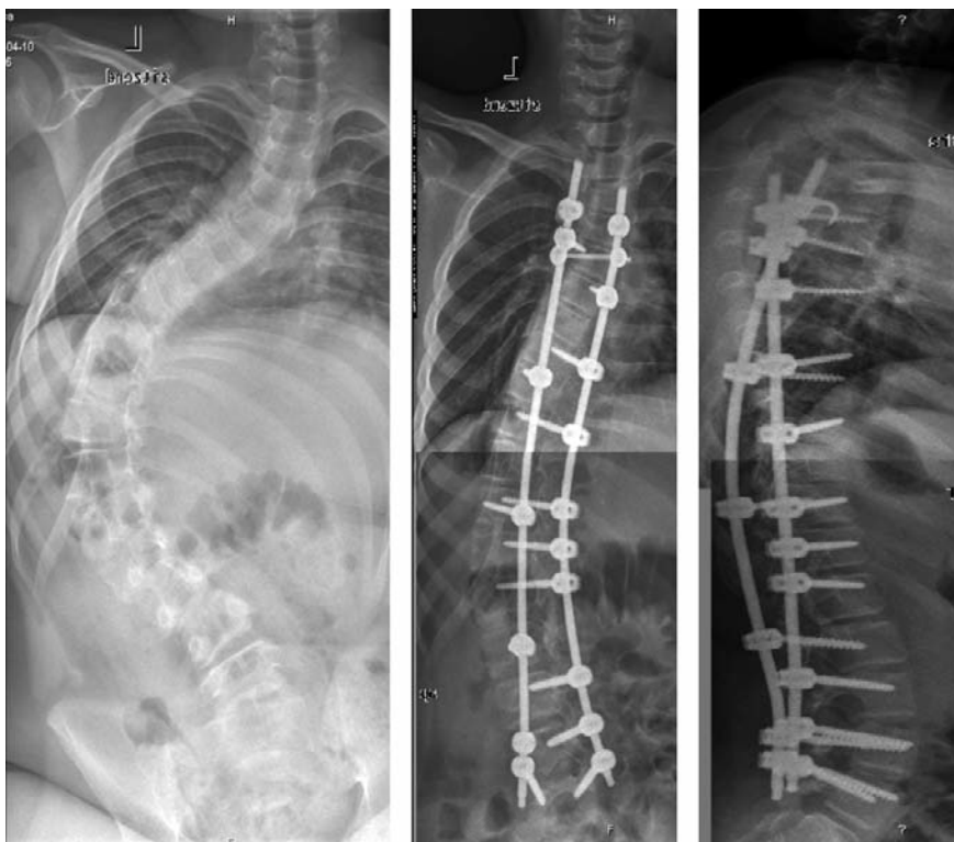
Figure 1. 12 year old patient with a left convex neuromuscular scoliosis. Radiological results two years after dorsal instrumentation spondylodesis.

Our results show that the ability to sit, stand