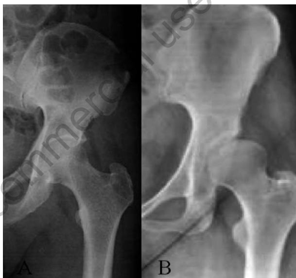
Figure 1. Comparative X-rays of a normal (A) and a dysplastic hip (B).

Association between age and center edge, acetabular angle, roof obliquity, extrusion index, lateral subluxation, depth to width ratio, peak to edge distance was observed. A very strong negative association was observed between age and acetabular angle ( r = -0.825 ), similarly, strong positive association with center edge ( r = 0.608 ), strong negative association with depth to width ratio ( r = -0.748 ), moderate negative association with extrusion index ( r = -0.498 ), weak negative association of age with roof obliquity ( r = -0.221 ) and lateral subluxation ( r = 0.384 ) and finally very weak negative association with peak to edge distance ( r = -0.011 ).