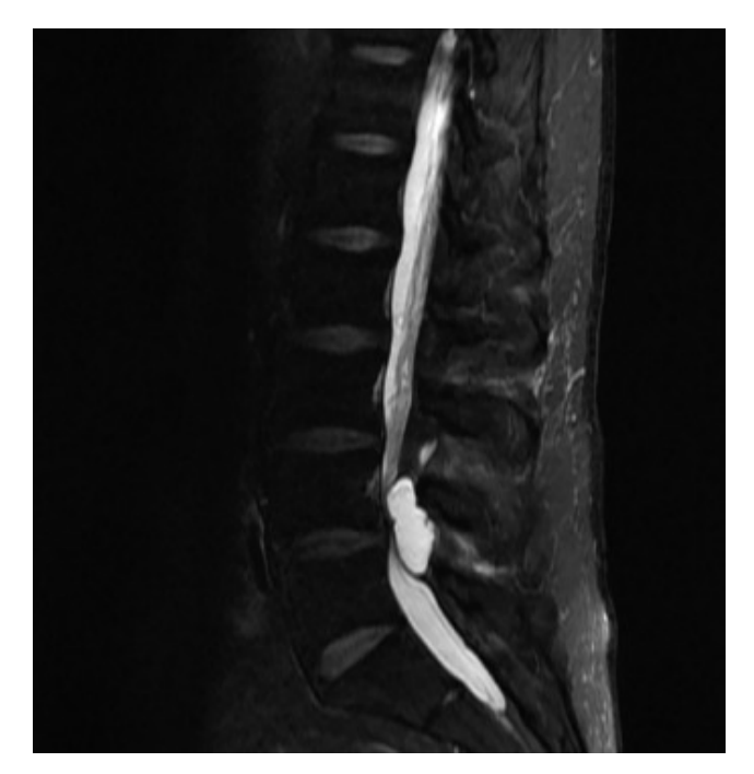
Figure 3. The cystic mass was shown on a sagittal "fat suppression" MRI scan and taken from Roberti et al.<sup>67</sup>

Ulrich et al. compared spinal decompression surgical outcomes of patients with SEL (n=14) to spinal stenosis patients without SEL at 1- and 2-year follow-up.<sup>74</sup> Pain, disability, and quality of life were assessed using Spinal Stenosis Measure (SSM) symptoms, SSM function, and EQ-5D-3L summary index (SI). The authors found that while disability was significantly improved in the patients with SEL at the 2-year post-op visit, pain and quality of life were not significantly improved. Ulrich et al. concluded that the SEL